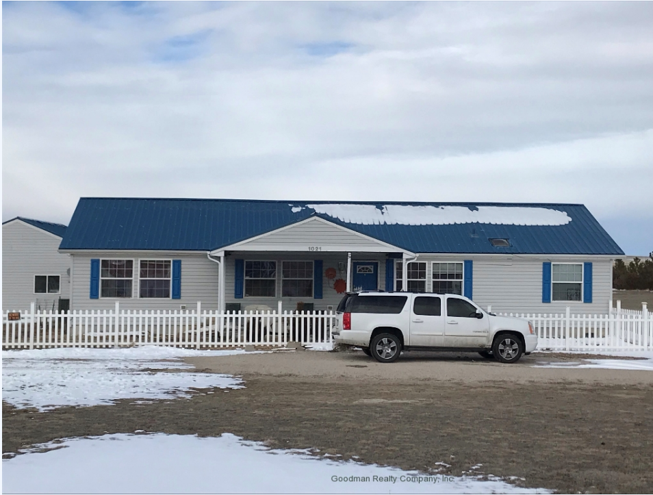
Goodman Realty Company, Inc.