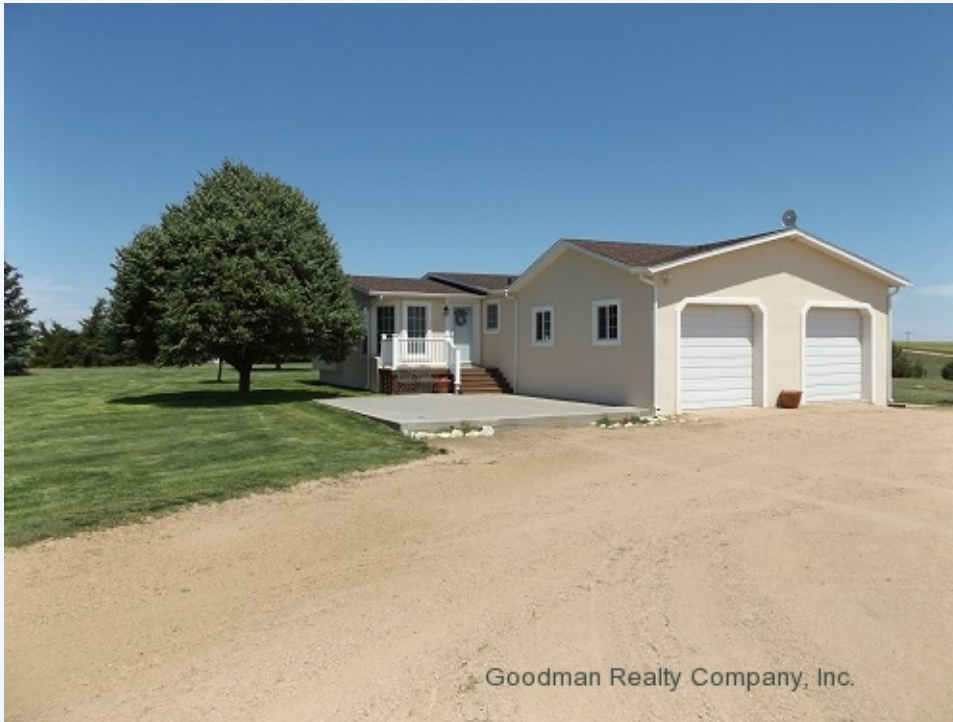
Goodman Realty Company, Inc.